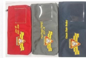
#1004 CENTENNIAL HAT BAGS – Three colors – blue for Shipmates, for National Officers or past National Officers (i.e. you have a "grey hat") and red for National President or past National President. The hat bag can be personalized for an added fee.