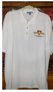
CENTENNIAL POLO SHIRT (MENS AND WOMENS STYLES) WHITE POLO MEN:#1005 WOMEN:#1007 BLUE POLO MEN: #1006 WOMEN: #1008 Two colors – white and blue. 65% polyester/35% cotton.