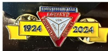
Centennial PIN #1001