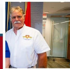
Centennial Button Down White MEN:#1009 WOMEN:#10011 CENTENNIAL BUTTON-DOWN SHIRT (MENS AND WOMENS STYLES) – Two colors – white and blue. 55% cotton/45% polyester.