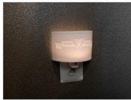
#1002 CENTENNIAL NIGHT LIGHT – LED night light to plug into wall with Dusk-to-Dawn Sensors. Automatically turns on and off. Use in any room!