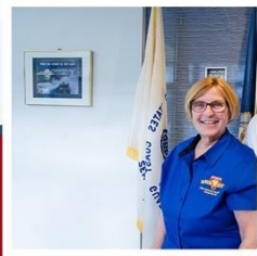
Centennial Button Down Blue MEN: #10010 WOMEN:#10012 CENTENNIAL BUTTON-DOWN SHIRT (MENS AND WOMENS STYLES) – Two colors – white and blue. 55% cotton/45% polyester.