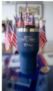
#1003 CENTENNIAL MUG – The 20 oz mug is stainless steel, double wall insulated. Keeps your drinks ice cold longer - works great for hot beverages. The included all-new shaded Splash Proof lid lets you know exactly how much drink you have. The flip-top closure resists spills and is straw friendly. Easy to clean and dishwasher safe.