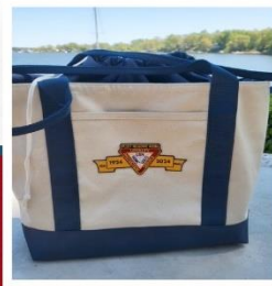
#1004 CENTENNIAL CANVAS BAG The Cotton Canvas Tote is made of 100% cotton canvas. External pocket is for easy storage, spacious interior with a gusset bottom and long contrast straps for a comfortable carry. The tote bag can be personalized for an added fee.